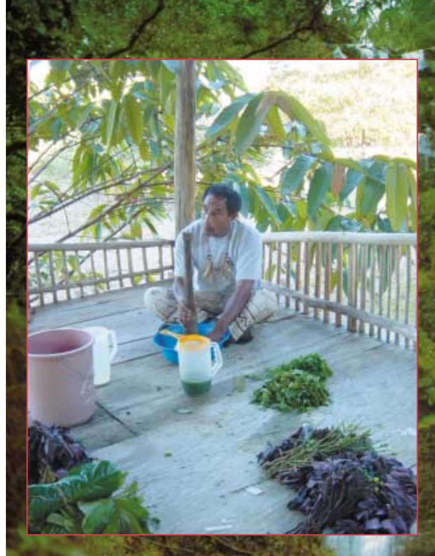
When you talk to the plants you will get to know them like friends, they have their own spirits, their own personalities.

To sample this for yourself, just find a quiet moment and space, close your eyes, and with the power of your imagination draw in the verdant, abundant forest, filled with life, colour and sound. Sense the rich vibrancy of the rainforest as a single breathing rhythmic totality of life force. When you have this image, expand it to include, the humid warmth, the smell of